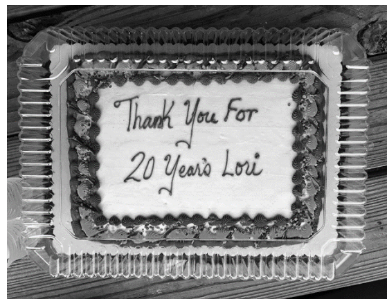
Lori celebrated 20 years of service!