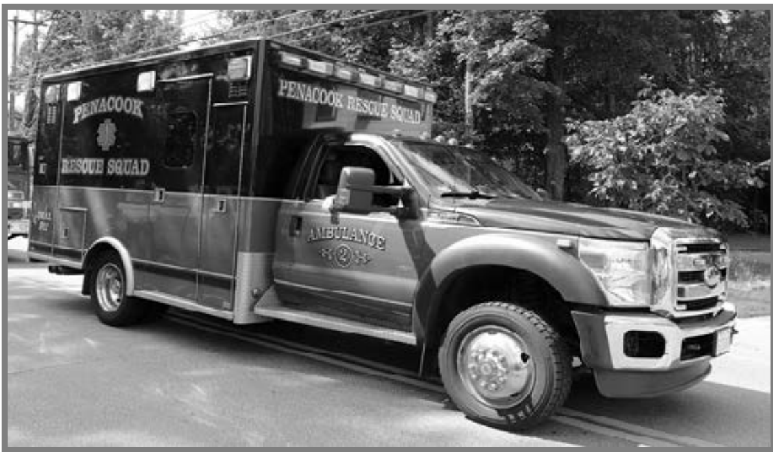
Boscawen Old Home Day Parade 2019