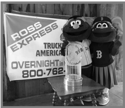
Red Sox mascots Wally and Tessie, brought the World Series Trophy to Boscawen.