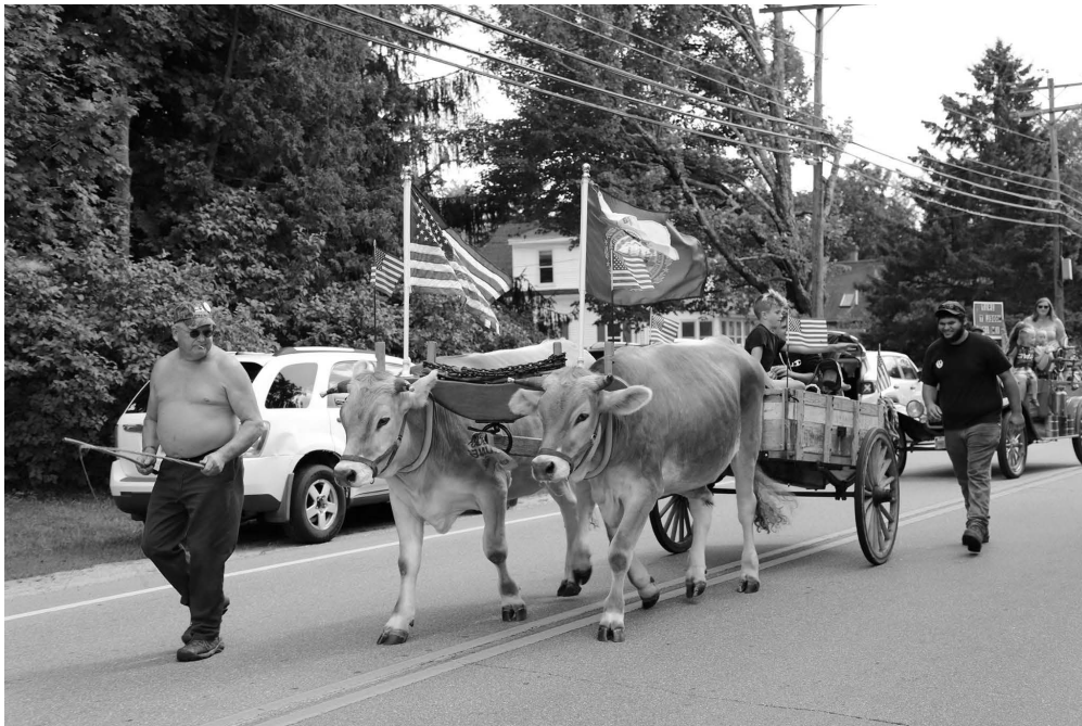
Boscawen still loves it's cows (oxen)