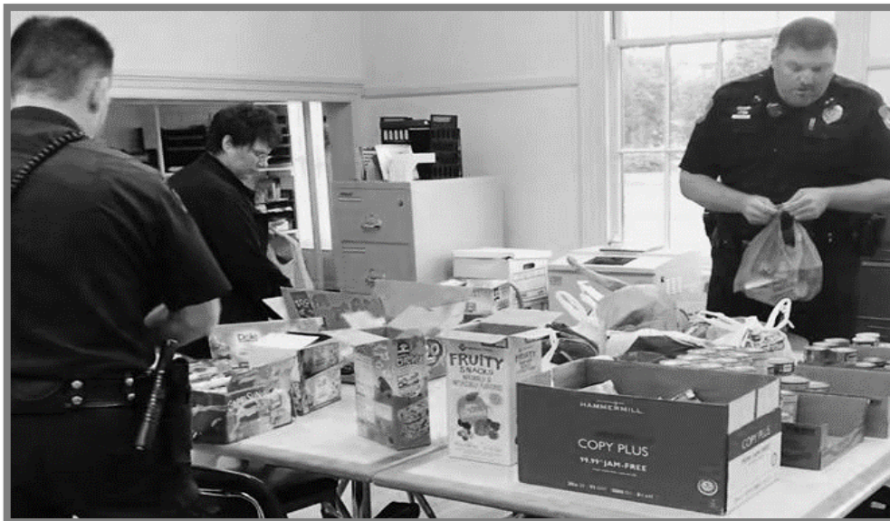
Boscawen Police Department helping to fill backpacks for the weekly children's program